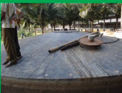
Poultry Litter Based Bio Gas Plants