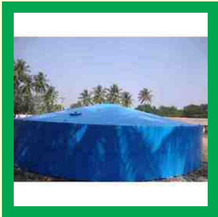
2000 Cum Fiber Glass Holders