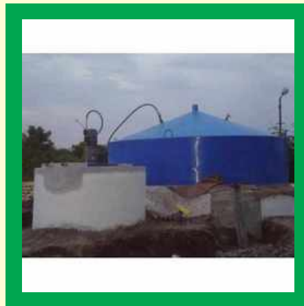
Industrial Canteen Waste Bio Gas Plant