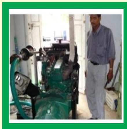
40 KVA Bio Gas Generators