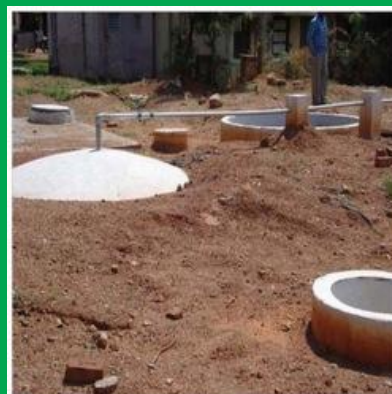
Consultancy for All Type Of Renewable Energy