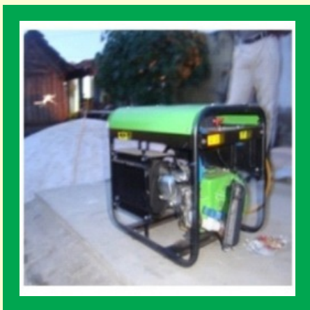
1 KWE Bio Gas Generators

100% Bio gas generators from 1Kwh to 500Kwh. Biogas refers to the gas generated by the biological breakdown of organic matter in the absence of oxygen.