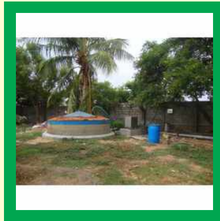
Food Waste Based Bio Gas Plant At Engineering College