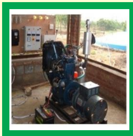
20 KVA Bio Gas Generators