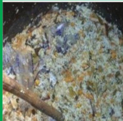
Food & Veg. Waste Based Bio Gas Plants