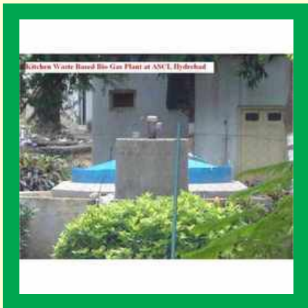
Food Waste Based Plant