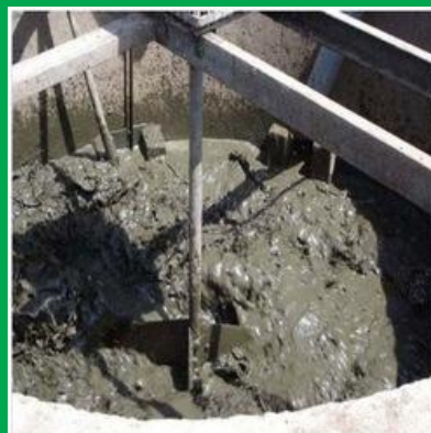
Biogas and Anaerobic Reactors