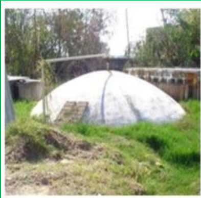
Night Soil Based Bio Gas Plants